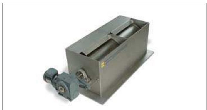
TM Drum Magnet

A distinct advantage is the ease with which magnets can be integrated into existing production facilities and their easy-clean design. Outstanding features include powerful magnets (Neodymium/SmCo) which are stable at extremes of temperature (up to 350° C) and resistant to corrosion.