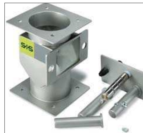
EXTRACTOR in-line magnet

S+S offers a complete range of magnet separators for production and recycling. Their primary use is the pre-removal of ferrous metals from bulk materials and packaged product and, with models designed for all types of materials, production stages and conveying systems (free-fall sections, pipelines, belt conveyors etc), they are an effective complement to inductive metal detectors and separators.