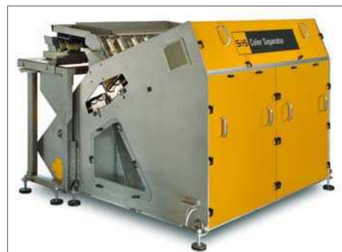
SPEKTRUM Colour Separator for flakes and granulate

S+S systems are built to a well-proven modular design concept to ensure that exactly the right combination of components is chosen to meet the customer's specific application.