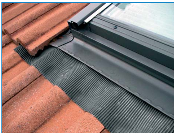
Dormer window connection with profiled lead sheet