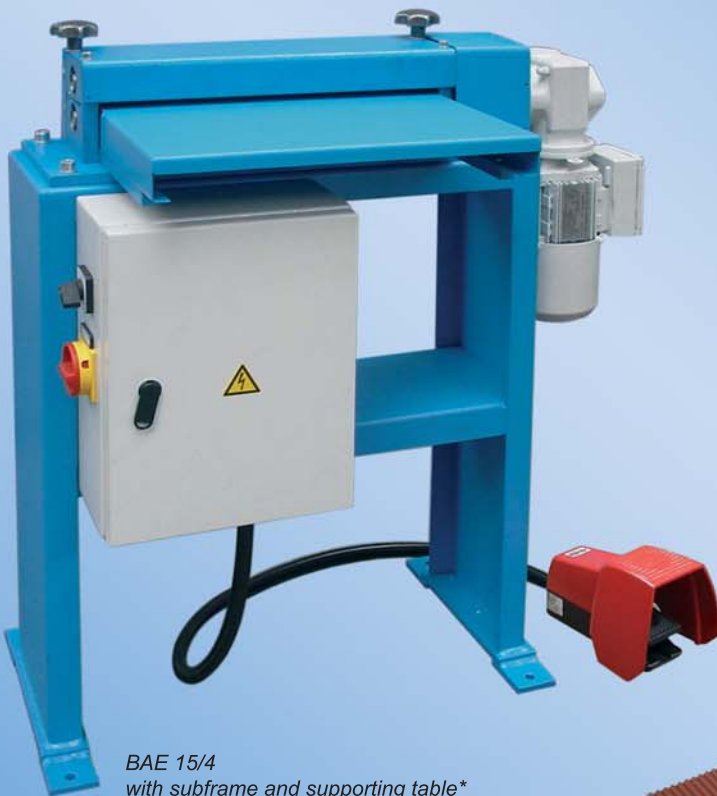
BAE 15/4 with subframe and supporting table*