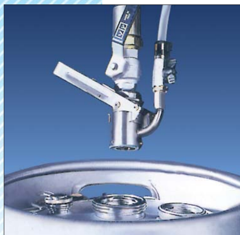
Filling coupling for used solvent

Once the empty SAFE-TAINER system has been delivered, simply fit the accessory parts into their correct position to make the connection. The air expelled as the container is filled, is automatically fed back into the machine via the integrated solvent vapour return hose. The container is fitted with an electrical overfill protection device which will switch the machine pump off automatically as soon as the fill level has been reached.