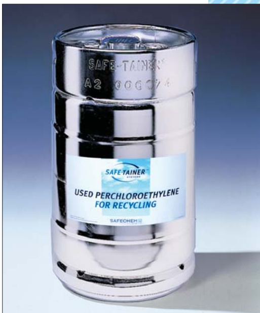
The SAFE-TAINER system for used solvent

The SAFE-TAINER system for used solvent can hold up to 50 litres and thanks to its double walls, does not require an additional containment system. It is easy to use, stackable and takes up very little room - a definite advantage during transport and storage.