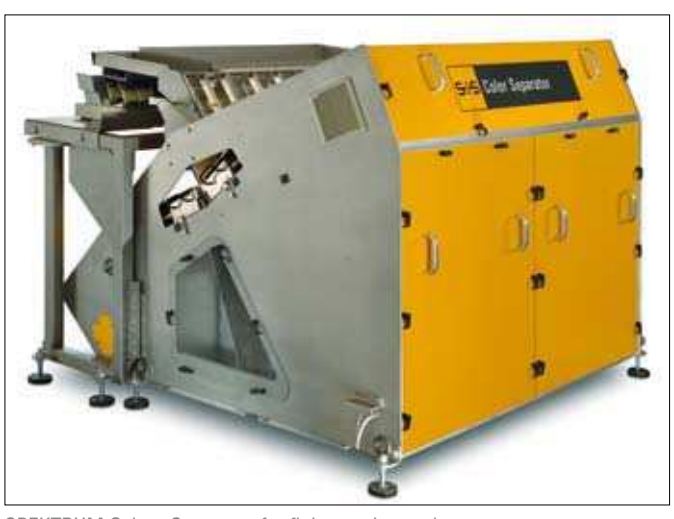
SPEKTRUM Colour Separator for flakes and granulate

S+S systems are built to a well-proven modular design concept to ensure that exactly the right combination of components is chosen to meet the customer's specific application.