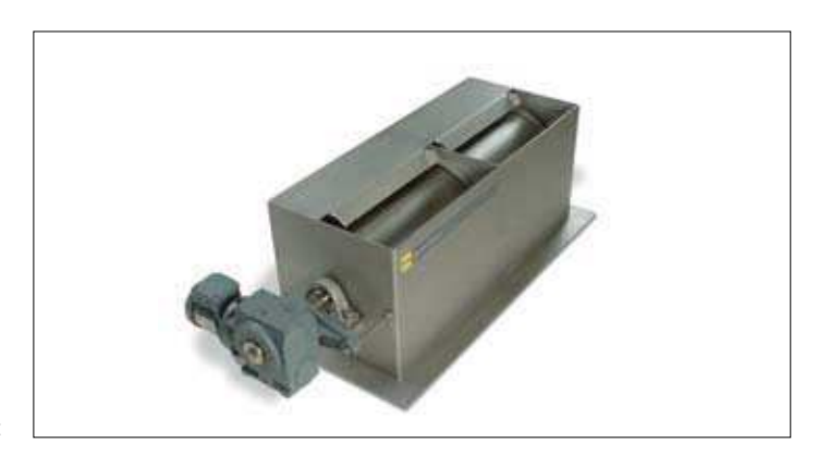
TM Drum Magnet

A distinct advantage is the ease with which magnets can be integrated into existing production facilities and their easy-clean design. Outstanding features include powerful magnets (Neodymium/SmCo) which are stable at extremes of temperature (up to 350^{\circ} C) and resistant to corrosion.