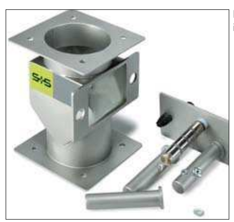
EXTRACTOR in-line magnet

S+S offers a complete range of magnet separators for production and recycling. Their primary use is the pre-removal of ferrous metals from bulk materials and packaged product and, with models designed for all types of materials, production stages and conveying systems (free-fall sections, pipelines, belt conveyors etc), they are an effective complement to inductive metal detectors and separators.