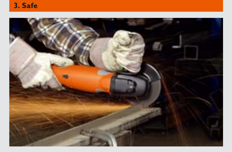
When safety is paramount – FEIN angle grinders with AutoStop and electronic brake system.

One characteristic of the FEIN WS 14 angle grinder is its unique ease of operation. This is most appreciated in continuous use.