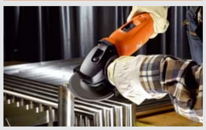
The adjustable speed range of 2500/min – 7000/min makes the WSG 14-70 E a universal angle grinder (for machining stainless steel for example).