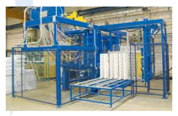
Picture 1 – HEITZ HBB 1412: Moulding machine with handling robot and stacking table. For the production of ICF elements with sheet metal or plastic connecting inserts, 3 elements per cycle.

Picture 2 – HEITZ ceiling element: assembled with 2 U-Profils (to be produced optionally in polystyrene and Neopor®). With reinforcement