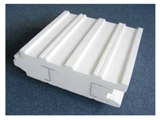
Picture 4 - HEITZ roof element: with 2 inmoulded U-Profils (to be produced optionally in polystyrene and Neopor®), shown in cross section.