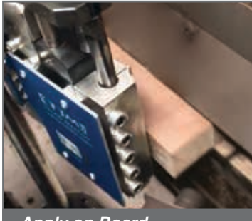
Apply on Board

Adapted to your process. Three format options available to fit in most any edgebander: Standard, Slim or Zero. Application may be done on the edge directly, by incorporating a specially designed bracket. Manual or motorized width adjustment options available.